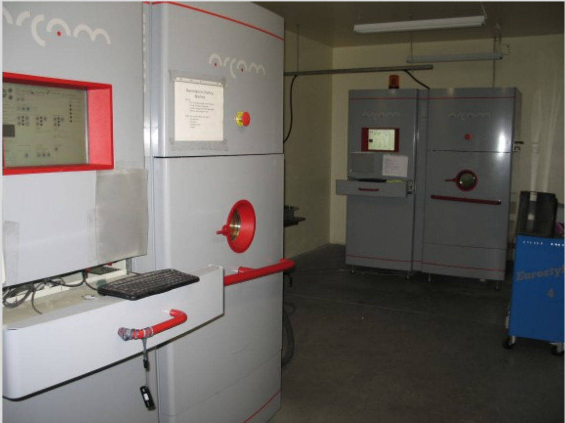
CalRAM's Two EBM Machines in Environmentally Controlled Environment

CalRAM recently procured a second EBM system. Both systems have been given a productivity upgrade with "Controlled Vacuum" (CV). This CV upgrade allows for a 33% increase in operational speed; a part that took 30 hours to build can now be built in about 20 hours. CalRAM also designed and erected an environmentally-controlled room to keep moisture away from the powders. This allows the metallic powder to be continually recycled without picking up oxygen thereby reducing costs and allowing us to pass the savings along to our customers.